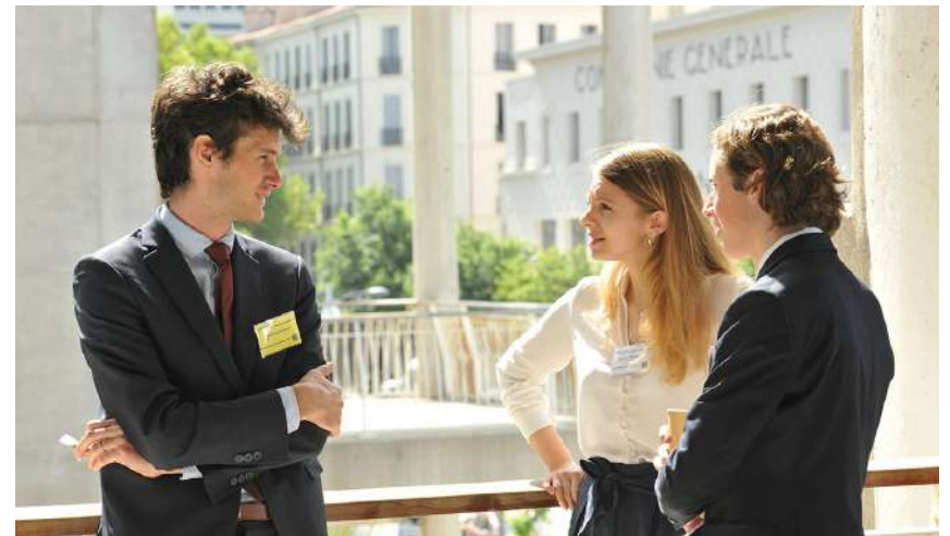
3 rd Executive Committee of the MEDports Association Barcelona, June 2019