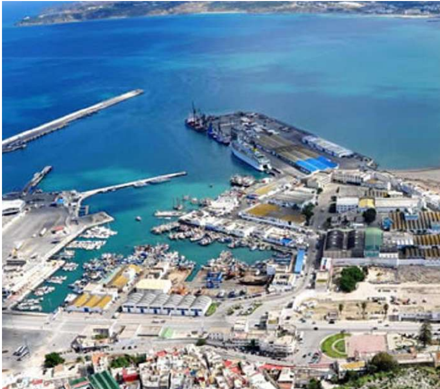
Safety & Security Committee April 2019, Tangier