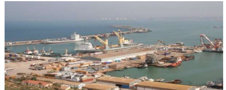
Safety & Security Committee Arzew, November 2018