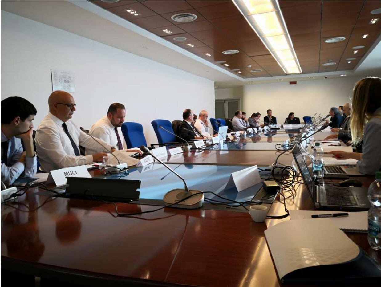
2 nd General Assembly of the MEDports Association Civitavecchia, November 2018