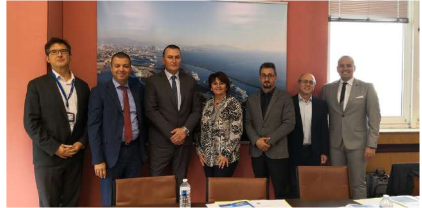
Safety & Security Committee Marseille, November 2019