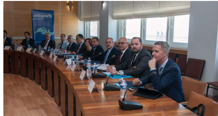
1 st General Assembly of the MEDports Association Marseille, June 2018