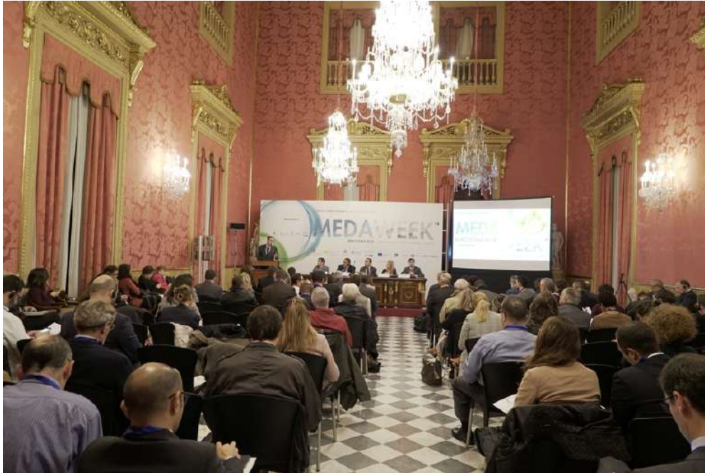
Meda Week Barcelona, November 2018