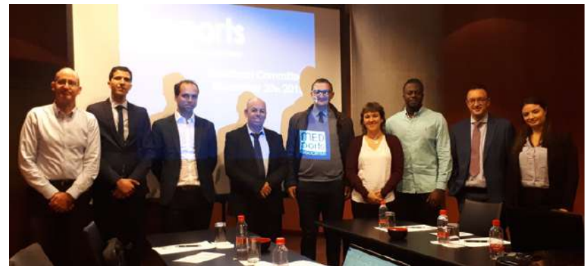
SmartPort Committee Barcelona, November 2019