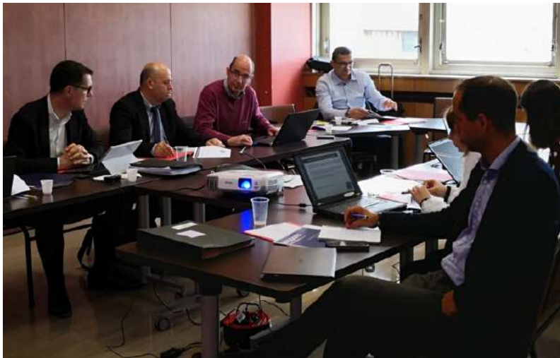
Employment, Training & Maritime Expertise and SmartPort Committees Marseille, March & April 2019