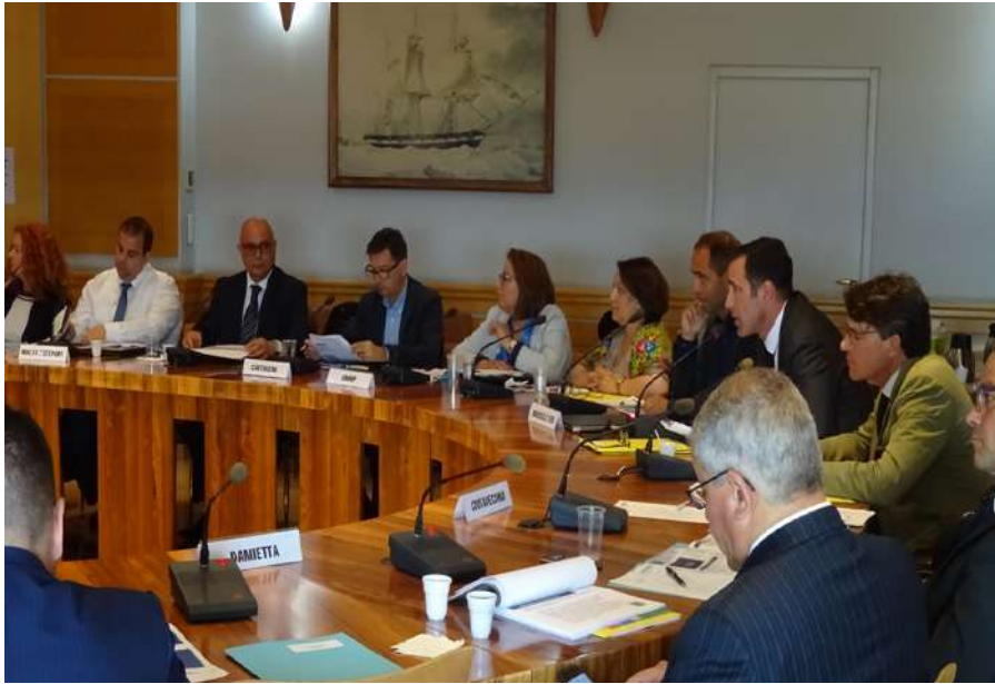
3 rd General Assembly of the MEDports Association Marseille, June 2019