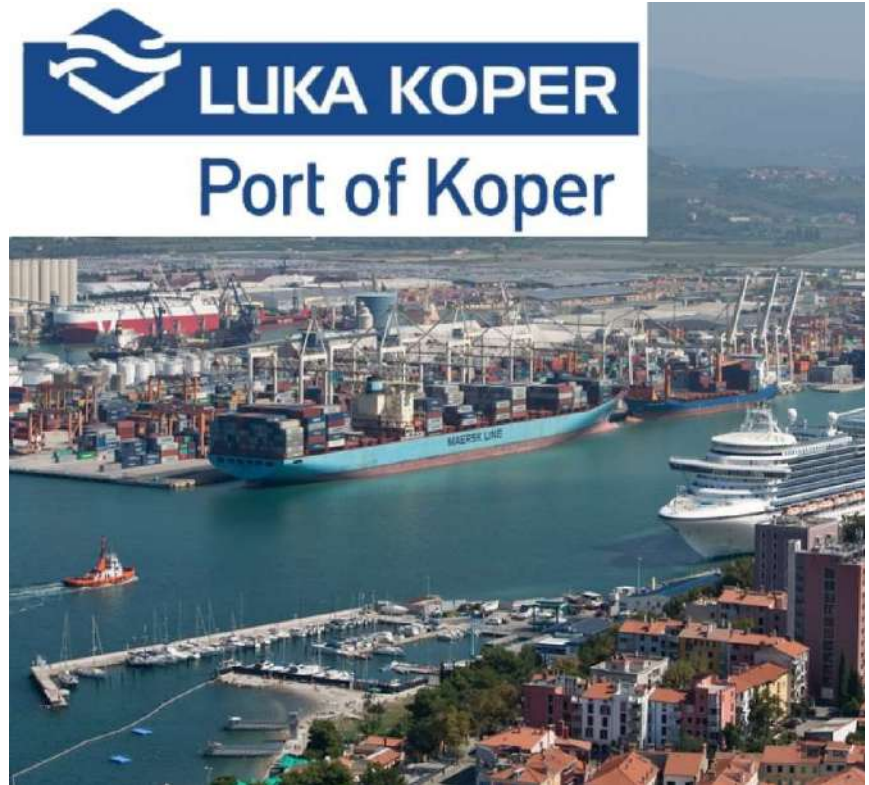
Statistics & Market Analysis Committee April 2019, Koper