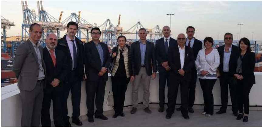
Sustainability Committee Malta, November 2019