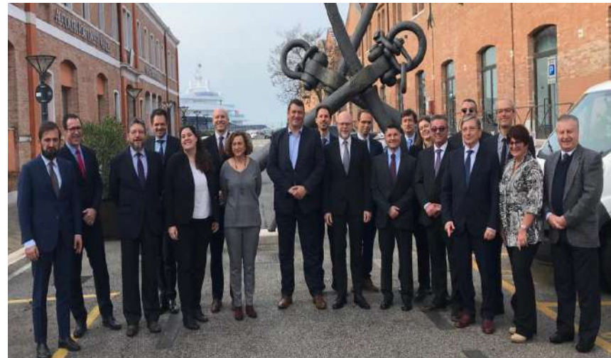
Training Seminar Barcelona, November 2019