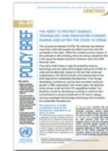
The need to protect science, technology and innovation funding