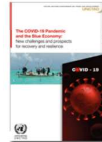
The COVID-19 Pandemic and the Blue Economy: