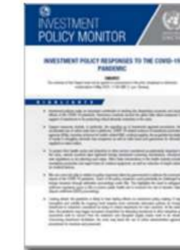
Investment Policy Monitor: Special Issue - Investment Policy Responses